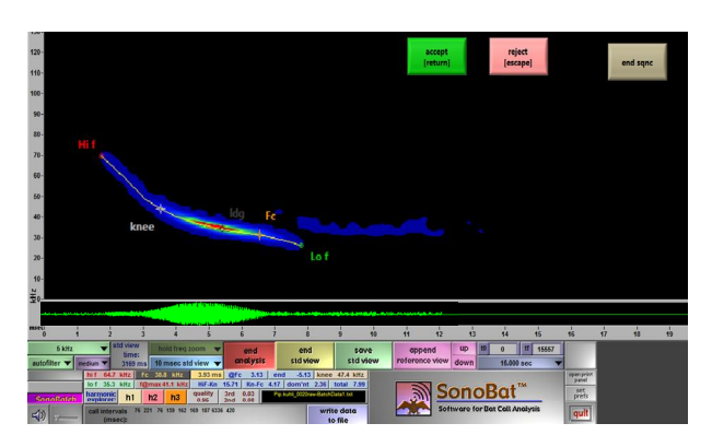
Figure 2 . Sonobat software used to extract parameters from echolocation calls.

outperforms the classification obtained with traditional parameters. This research was presented at University College London in May