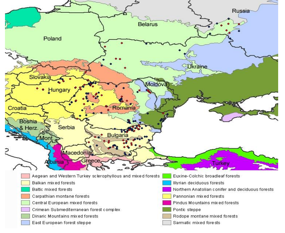
Figure 1. Transects carried out in Eastern Europe from July 2006-Oct 2009, including new transects in Hungary, Ukraine and Western Russia. Blue and red circles represent survey and monitoring transects, respectively. Colours represent WWF& Ecoregions.